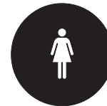
RESTROOM / WOMEN