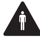
RESTROOM / MEN

High Impact Polystyrene, California Title 24 Restroom signs.