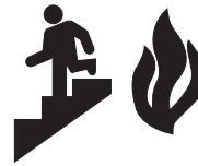
IN CASE OF FIRE . . .