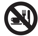
NO FOOD OR DRINK